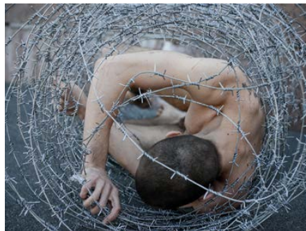
Petr Pavlensky, The Carcass action, May 3, 2013 Courtesy @Saatchi Gallery

MG: Radical artists are not simple people. They see things in a special way. They can easily go against the law, sometimes even against friendship. They want to say