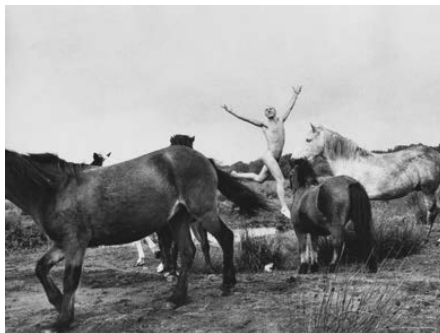
Oleg Kulik, Horses of Bretagne 4, 1998