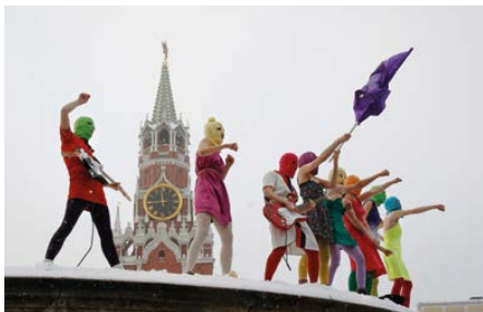
Pussy Riot Run Riot on the Kremlin Wall

SH: What sort of works does the exhibition consist of?