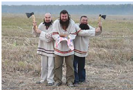
Blue Noses Art Group