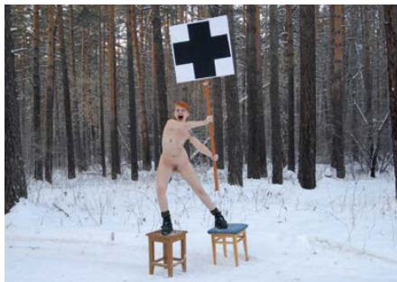
Blue Noses, Suprematist bannermen